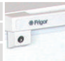
The GLE and GLK comes with a handle lock