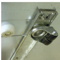
Set of castors - optional