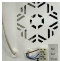
Socket for remote alarm